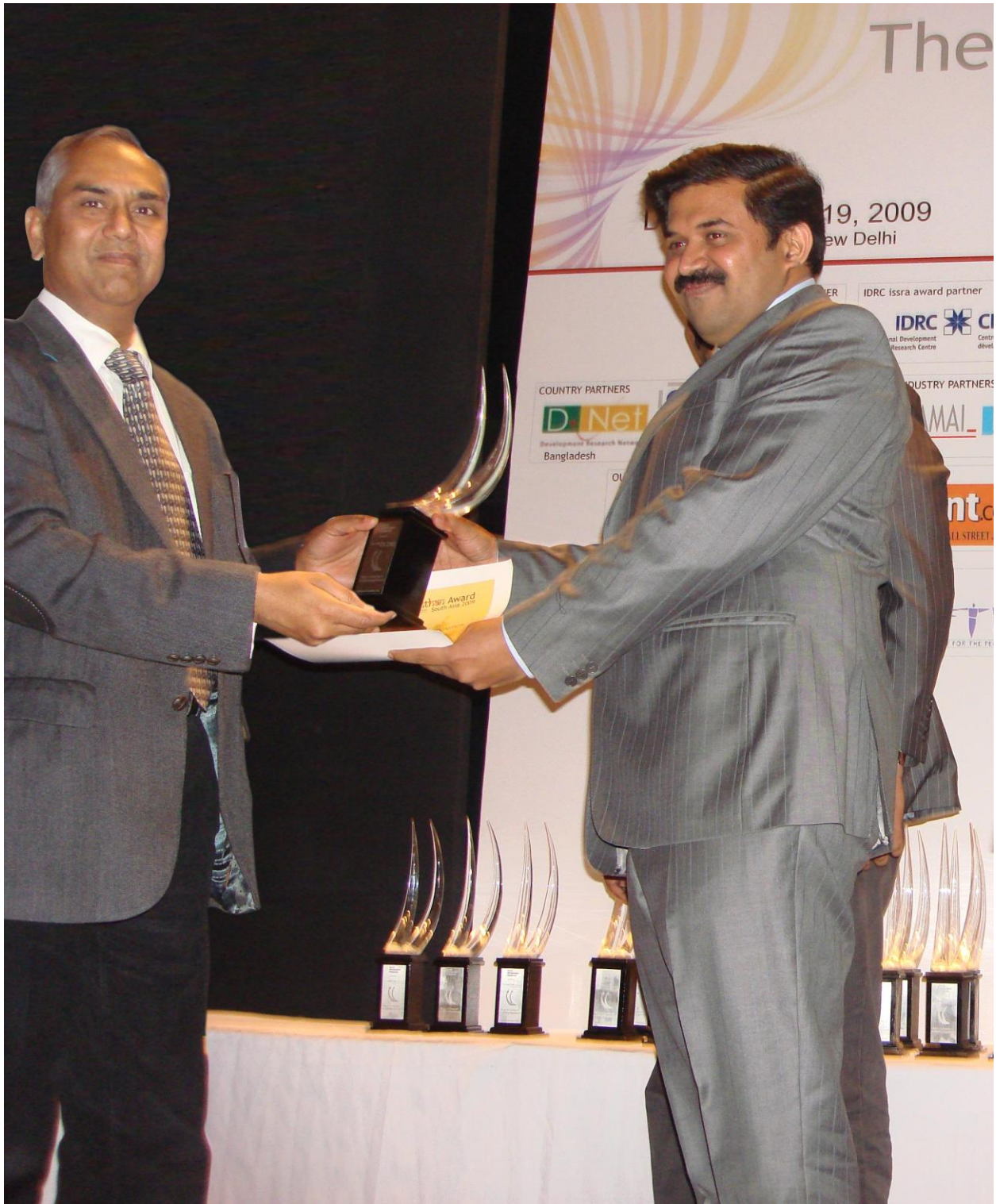
Manthan Award South Asia being received by CEO of Aarogyasri Health Care Trust at New Delhi on 19 th December 2009.