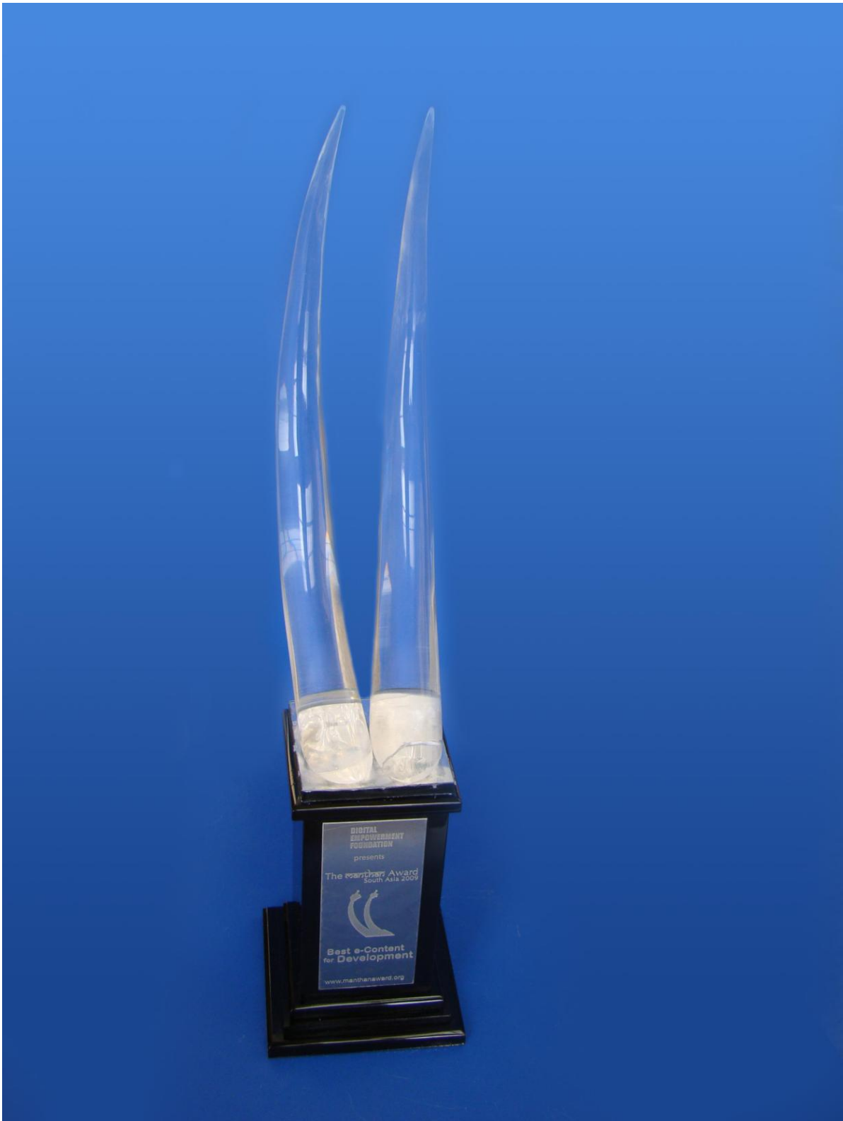
The Manthan Award – South Asia 2009.